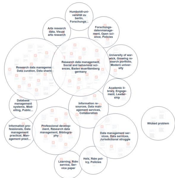
FIG. 2 CURRENT LANDSCAPE OF RESEARCH DATA MANAGEMENT [7]

The following images show the current setting of data sharing and research data management. From the OpenKnowledgeMap , in which it relates with SHARE database, we could see the following components that are largely involved in the subject: (1) skills (related to human resources), (2) technology including software and hardware, (3) easy to follow guidelines, including IPR and legal related documents.