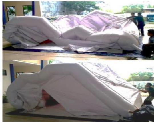
Fig. 1. Setting-Up Process of Inflated Portable Structure