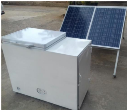
Fig. 3. Cold Storage Solar Cell for fisherman

The availability of Inflated Portable Cold Storage House technology Prototype with Solar Cell which has speed and effectiveness in the process of transportation, assembly, installation, dismantling, tested thermal comfort (temperature, humidity and air pressure) and tested in Lab and Field is needed for Fisherman.