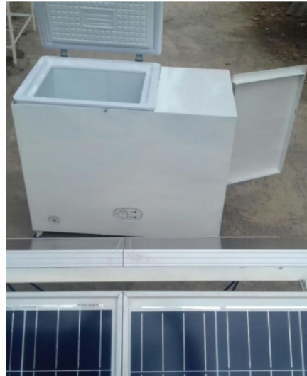
Fig. 4. Cold Storage Solar Cell Details for fisherman

Placement Inflated Portable Cold Storage House is flexible, it can be in residence / housing so it can be applied to the urban community. Technology of Inflated Portable Cold Storage House with Solar Cell has high prospects for mass-manufactured by Industrial Partners, due to the high demand for fresh fish urban and inadequate availability of hygienic fish production, but cheaper.