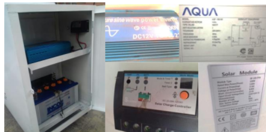
Fig. 5. Cold Storage Solar Cell specification for fisherman