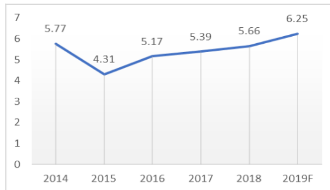
Figure 1. GDP Growth in the Consumer Goods Industry Sector 2019 In (%) Resource : BPS, Kemenko Perekonomian, 2019

Seeing the importance of financial distress for internal and external parties of the company as well as the latest research on financial distress for more actual information in making decisions for the parties, a study will be conducted under the title “Predictions of Financial Distress in Consumers' Goods Industry Companies Listed on the Indonesia Stock Exchange at 2016-2018”.