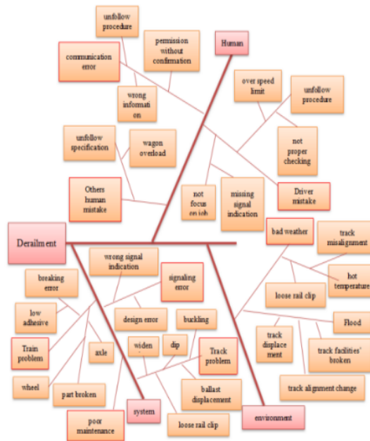
Fig. 2 - Ishikawa diagram of derailment.

Fig. 2 shows the Ishikawa diagram of derailment with 8 main tributary factor. Those are “communication error”, “other’s human mistake”, and “driver mistake” under human element; “train problem”, “poor maintenance”; “track problem” and “signaling error” under system element; and “bad weather” under environment element. It also shows current procedure is not enough to prove this system in high level of safe condition. Result from root cause analysis it can be conclude that there are 10 contributory factor has been selected to be independent variable for prediction model process.