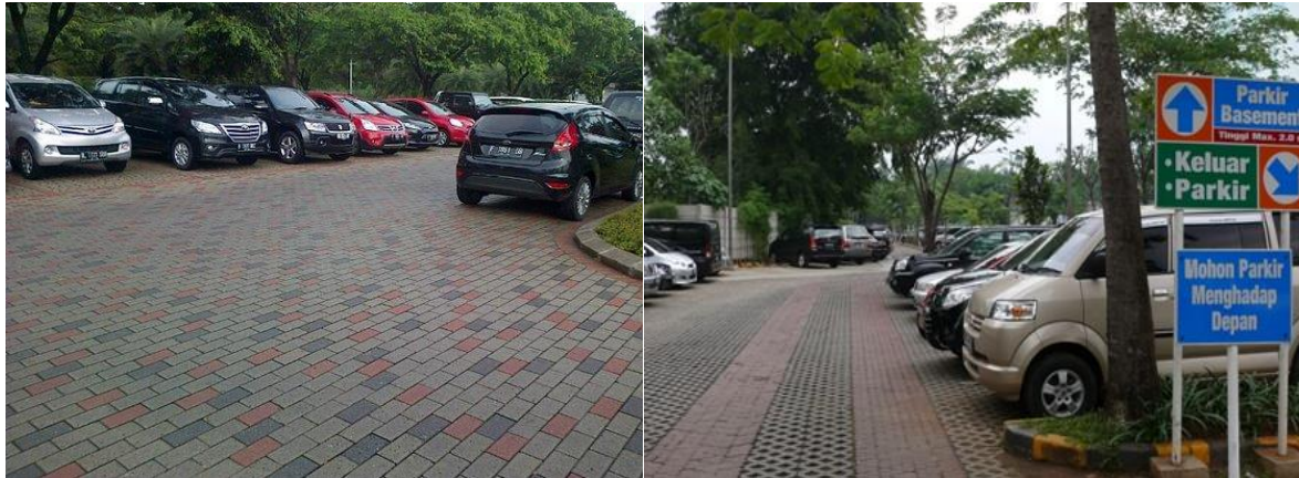
Figure 1. Pavement of parking area made of conblock.