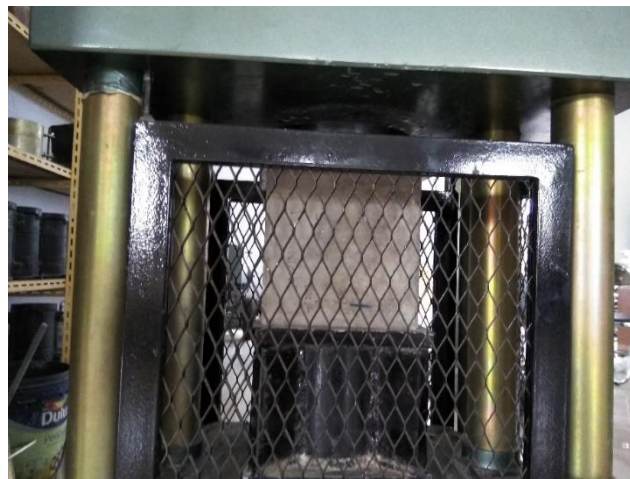
Figure 2. Compressive strength testing process in test objects.